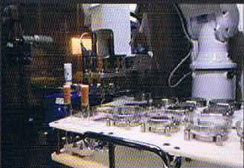
Petri dish lid closed