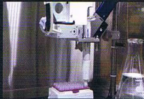
Grab pipette and attach tip